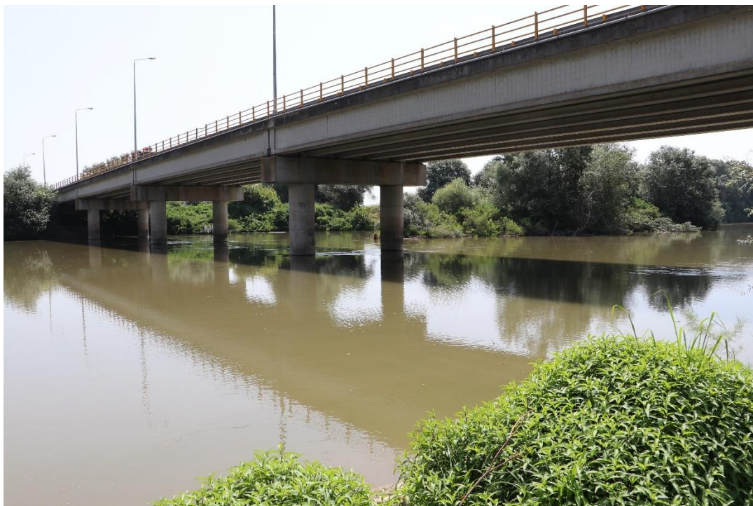
Picture 1. Photo of the installation site on the Malgara bridge