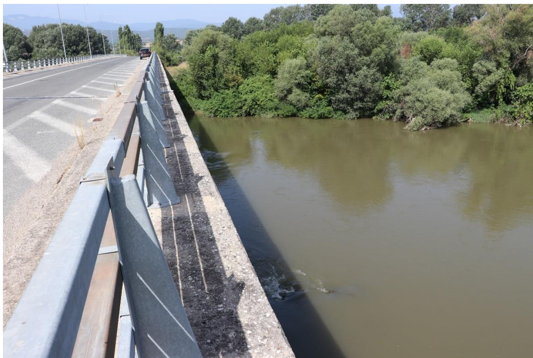
Picture 2. Photo of the installation site on the Idomeni bridge